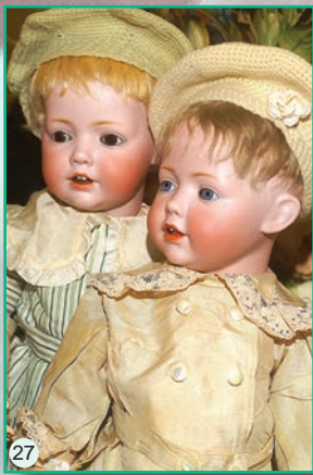
27) Deluxe 19" Hilda Toddlers - a '237' w. blue eyes. $2700; a '245' w. brown eyes. $2500. Both fully jtd. wearing posh Silk Suits!