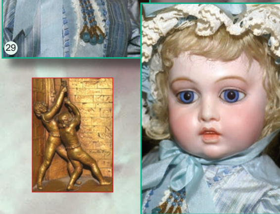
31 & 32) Deluxe 16" K*R 115a Pouties - Choice characters w. powder fine bisque, bl. sl. eyes, Factory Wigs & Jtd. Toddler Bodies, lovely old clothes & Leather Shoes He has an Italian Boutique Label. Sensational models! Each $1800