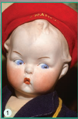
1) Rare Heubach 15" Googly - important '8555' UFDC winner Comic Character! Fully Jtd. tyke, intaglio eyes, 3-mld.tufts of hair, pursed lips & Vintage Sailor Suit plus snappy Shoes! A spry child! Only $2500