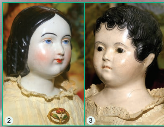
2) Rare 23" 1850's 'Sophia Smith' - great find, 13 long 'hang curls', oval face, dainty chin, great Original Clothes & Body , porc. arms. Body will also sit. $2850