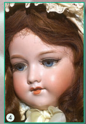
4) Stunning 37" 'Block Letter' AM Child - gorgeous mint bisque, 17" head, bl. sl. eyes, good jtd. body & lovely clothes. Lifelike! Only $650