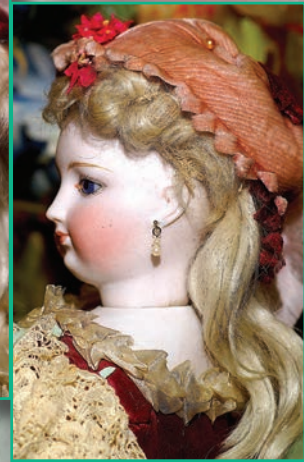
30) All Original 18" Poupée w. Bisque Arms - pristine quality Empress, extravagant Factory Wig w. Waist Length Braid, Blue PW's, clean firm body, Elegant Silk & Textured Lace Gown w. Muff & Parasol. $3750