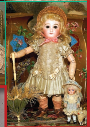
33) 'Adeline' - 12" Premier Jumeau in her Original French Trunk - with her name! Pristine orig. body, coil & pate, 8-heirloom garments, coat, 3-chapeaus, Orig. Shoes, Fringe Silk Parasol, 2" fan, stanhope, Fr. Photo Album, necessities, vanity set, etc. A treasure trove for a rare 1880 Bebe! $8200