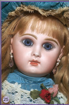
25) Very Pretty 19" Tete Jumeau - fully sgnd., vivid blue PW's, creamy bisque, mint French hh wig & Jumeau body w Coil, tiny mend rear rim, stunning custom Ensemble. $3500 just $1850