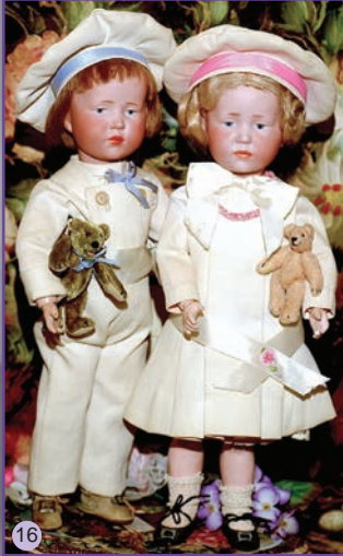
16) Charming Pair of Pristine K*R 101's - 12" cabinet size 'Peter & Marie' in Matching Tailored Ensembles w Factory Wigs & Shoes, flawless bisque & No Wig Pulls! Ever so sweet! Only $2495