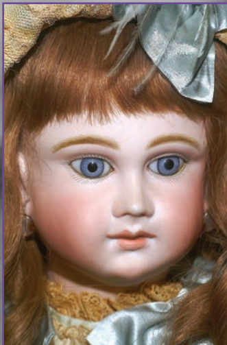
27) Breathtaking 24" Bebe Schmitt in the Grand Manner - Rare beauty w immaculate pure bisque, dewey sheen, perfect sculpting, dreamy Blue PW's beneath shaded eyelids; Orig Stiff Wrist Schmitt Body, mint french hh wig plus handmade glistening Silk Couture in the high style with brimmed Presentation Bonnet. A pristine showpiece! $14,500