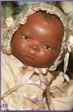
15) Rare Brown Byelo - sgnd. 12" head, sl eyes, brown lids & fabric body/celluloid hands, elaborate pink Silk Vintage Ensemble; a prize! $1495