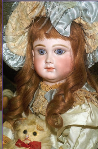
28) 19" Rare Brown 1880's Halbig '739' - supermodel, Factory Wig & Body, quality color bisque, brown PW's, in wonderful fancy Silk Ensemble w Pinafore & Wired Bonnet. Luscious luxury! $2250 29) see #28