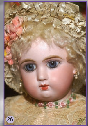
26) An Illusive 20" Closed Mouth Jullien Bebe - early 1890's mark; She's a Portrait Style Bebe w rich & round Blue PW's, lovely tender bisque, shaded lids, mint Mohair Curls, plus most lovely Vintage Couture w. Matching Leather Shoes. $3200