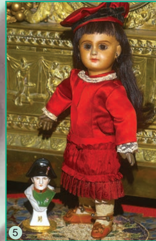
5) Super Rare 10" Brown 'Size 1' Danel et Cie 'Paris Bebe' - when will you see another?! Sgnd. Head, Closed Mouth, PWs, pc'd ears, Original Body incl. neck plug & Cork Pate. Pretty Antique Leather Shoes, French HH Wig. A special treat for the 'black doll' or 'Size 1' collector! $4200