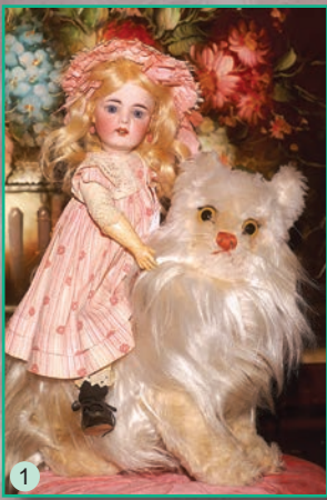
1) 14" Rare 'Bru Face' Cabinet Name Doll 'ELSA' - An angel with blue PWs, early Square Teeth, pretty bisque, mint antique Mohair Hip Length Tresses, adorable pink vintage clothes and Stiff Wrist Body. A bon-bon! $1650