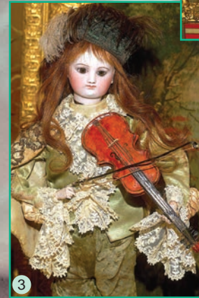
3) Magnificent 18" Vichy Violinist in Original Clothes & Wig - your other fashions will adore this handsome troubadour with his Bru Era bisque head as he 'serenades' (over wound) them with his Original Violin & Bow. Drenched in his fine Original Silk Clothes & Plumed Hat he strikes a seductive pose lounging casually onto one hip. $4500