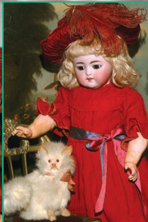
4) 18" Early Simon Halbig '908' Closed Mouth - mint 1888 French Export treasure of flawless quality, glowing PWs, Bru Tongue & early Solid Crown. Plus gorgeous mint Schmitt type Body, heirloom clothes & Factory Mohair Wig. The ultimate! $3250