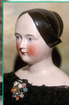
7) 22" 1840's Pressed China 'Damenkoph' - Rich Pink Tint matte finish & darkest 'brown' hair. She is KPM style with Winged Hair Panels & Coiled Bun high up in back exposing her lovely long neck. Elegant old gowns & body with long glazed arms. A Master Portrait. $1895