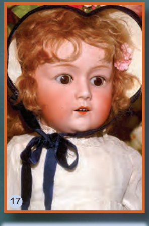
17) Unusual 27" Dainty Dorothy by Heubach - mold 10633; orig. body will sit , heirloom clothes, perfect bisque & body. $350