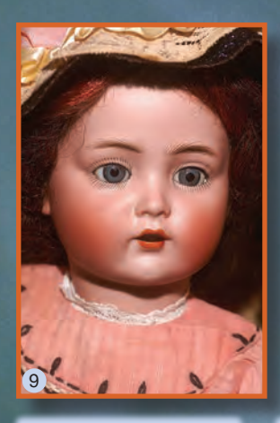
9) 20" 'Mein Liebling' K*R 117n - cunning blue eyed beauty,auburn hair, rosy blush, KR body. Plus her saucey Period Clothes . All Mint! $795