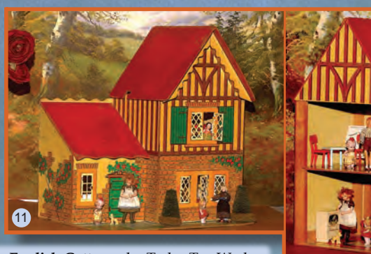
11) Fairytale English Cottage - by Tudor Toy Works; colorful details & 3-big rooms, fully furnished with scarce kitchen (dolls nfs), 17" tall. $295

12) Large Factory Dressed 11.5" AM '254' Googly w/ Teddy- striking quality big boy w/cunning smile in his colorful Orig Clothes & Hat! $695; Heubach '262' Googly - 7.5" chubby Toddler w/intaglio eyes, carved teeth & dimples! Plus Factory Romper! $395