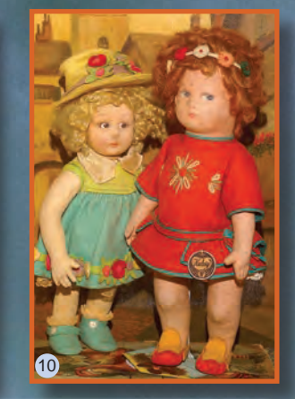
10) Adorable 12" Lenci Character - oodles of tiny curls & be-flowered bonnet! $375. Rare 13" Australian Lenci type Hubsy w/ Hang Tag & original clothes.Really unusual! $395