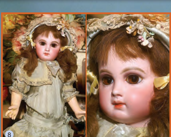
8) Sumptuous 16" E.J. Bebe - shaded lids, dreamy eyes, Orig Sgnd. Stiff Wrists Body & Coil plus Mint Factory Wig/Pate, invis. hidden flaw and elegant French Silk Dress. $4250