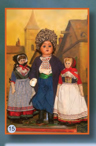
15) All Orignal 15" Russian Bisque - gl eyes & wonderful clothes includes Hang Tag, fully jointed quality body. $650; Seldom Seen Danish Fabric Doll - rare mint 12" sister dolls both w/Orig. Sgnd. Factory Shoes! $295 each