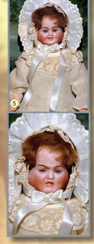
5) 12" Three-Face "Talking" Doll - smiles, cries w/glass eyes plus sleeping face; All turn by knob, working Pull Cord Crier , orig. Wig & Clothes ! No facial scuffs! $950