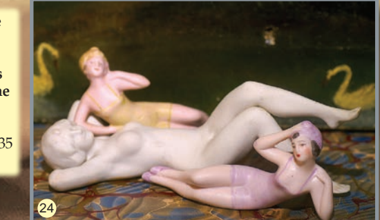
24) 5.5" German Deco Bisque Bathing Beauty mint pure white Art Doll w much detail. $125: Pair Hertwig Bathers Signed Germany in excel condition. $70 each.