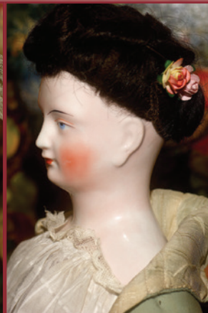
28) 22" Pink Tint Rare Brown Eye 'Kinderkopf' ca:1840 - rich facial coloring, Brushstroke Hair, wonderful vintage body & clothing, typical crack on plate under clothes. Only half price at $850