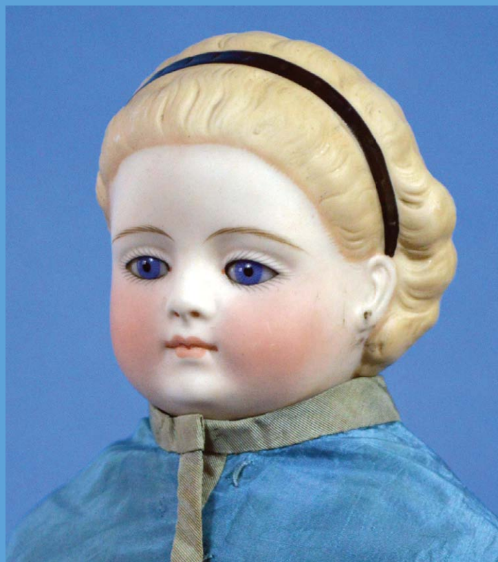
With some changes to the sculpt of the molded hair, another version of the doll could be created. This example is 19-inches tall, a shoulderhead on a cloth body with slender bisque lower arms and pierced ears. With her Alice hairstyle, she could be a lady or a child.