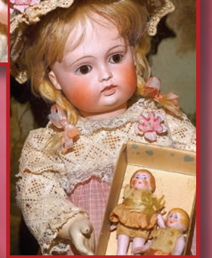
9) 21" Kestner 143 Squire - top quality, mint Factory Wig, Orig. Kestner Body & charming period Short Suit - hoping for love! $850; 19" Picture Perfect Eden Bebe - peaches & cream bisque, rich PW eyes, Orig Hip Length French Curl Wig, as seen in Tina Berry Book. $2250