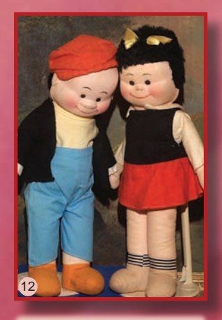
12) 14" Nancy & Sluggo Pair - ca: 1935 - beautiful clean condition w/ bright colors. He still has his hat & she her bows! $450