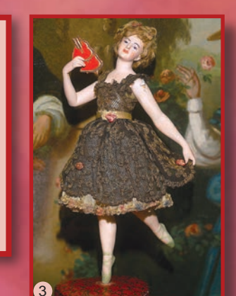
3) 9" French Export Bisque Ballerina - All Orig. Gold Mesh Tutu w/ jtd. arms & swivels on a heart shaped base w/ French Label. $895

11) 18" 1860's Snood China - rare color, mld/ ptd. hair band, quaint old clothes, later body, perfect head. $495; 21" Flesh Tint Male - multi brush marks! Orig. Body & 4-layers of dress suit, prof. invis. rear plate mend. only $375