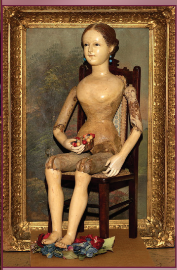
4) 'Anna Eliza' - A Rare Jointed Wooden - stunning at 22" tall, seated height only 12". All Original Classic w. a 3-generation Written Provenance dating to 1827. Near mint and one of a kind historic doll! $2500

5) Spectacular 29" Ribbon Winning Continental Wooden Lady - ca:1790's, Aristocratic Portrait Doll w. glass eyes, pc'd ears, carved and painted hair w. bun, fluid joints for sitting, shapely torso, slender gessoed arms w. long elegant fingers, majestic antique gown. A museum worthy rarity! $7200